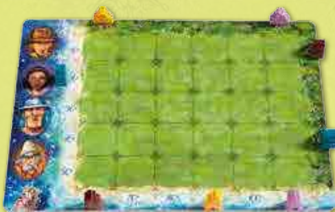
Here is what the islands could look like